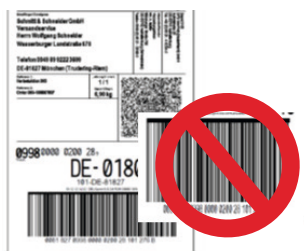
Don't use your own Code 128