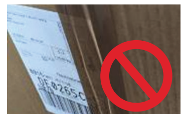
Don't conceal or cover the label