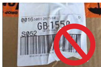
Avoid creases in the label