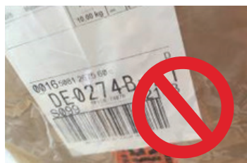
Don't apply the label under wrinkled film