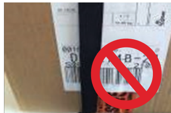
Don't apply strapping across the parcel label