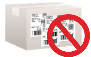
Remove old barcodes and parcel labels