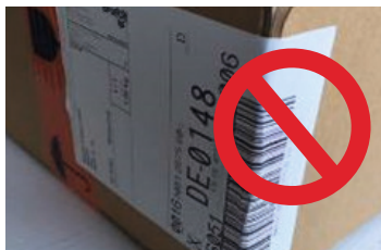
Don't fold the label over

The parcel label should be applied to the top of the largest side of the parcel. It must not be concealed or creased in order for the shipping to function smoothly.